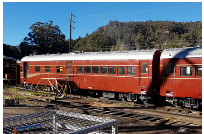
World's first solar powered train Byron Bay Railroad Company with Energus