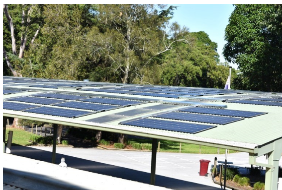
Solar COLA, Gordon West Public School 31.7kW