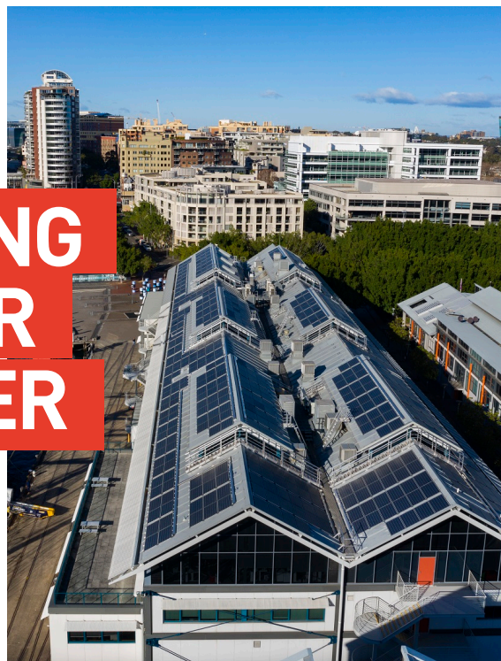
Australian Maritime Museum, Darling Harbour 235kW