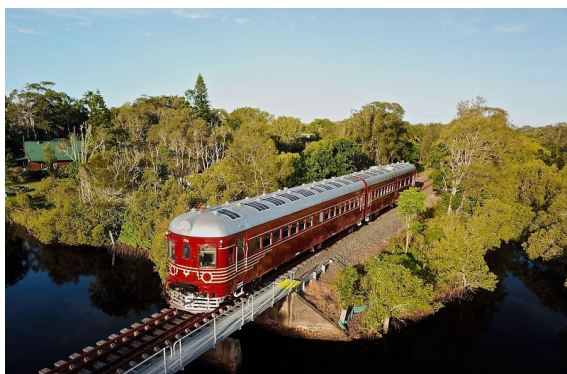
World's first solar powered train, Byron Bay 6.4kW